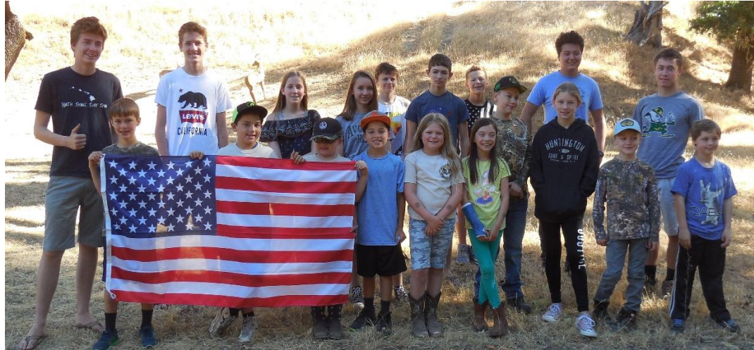
Some of the kids from the Family Weekend Event on a great weekend at the Hedgpeth, June 23-25.