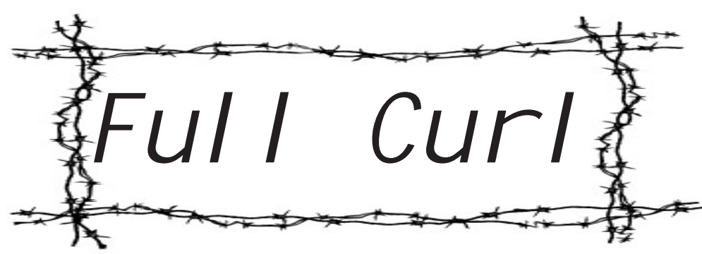
The Golden Ram Ultimate Sports Challenge