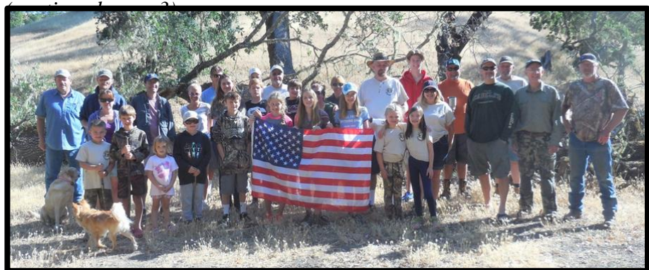
Group photo of the 2017 family weekend event. We know it's small and hard to see everyone's faces but that just means you need to come to next year's event to see everyone in person and to see what you are missing out on.